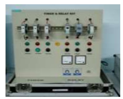
TIMER & DELAY