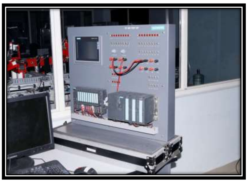
SIMATIC S7-300 TRAINING KIT