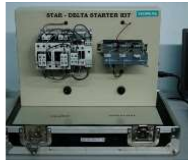
STAR DELTA STARTER