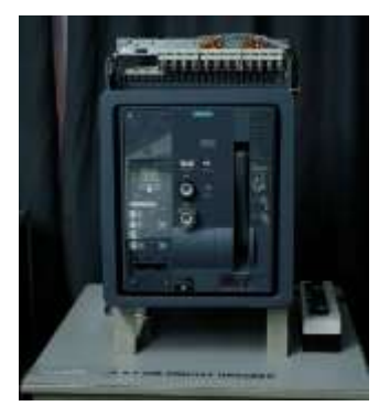
AIR CIRCUIT BREAKER