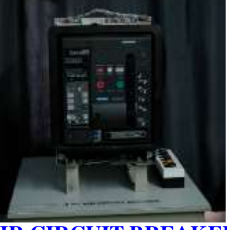
AIR CIRCUIT BREAKER WITH PROFIBUS COMMUNICATION