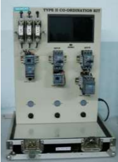
TYPE II COORDINATION