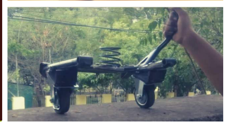
Copyright © 2018 Indian School of Business, All rights reserved.