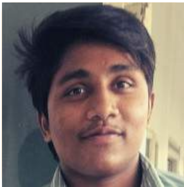
Pujari Ramu College: Sasi Institute of Technology & Engineering